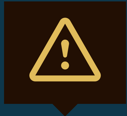
Constant monitoring and early warning